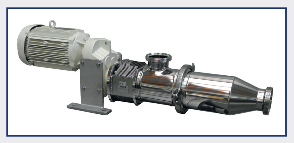
INDAG ECO series mixer