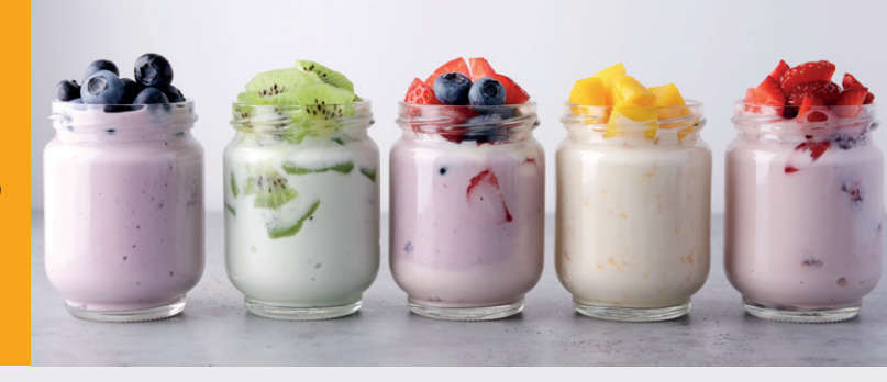
page 2 / 2