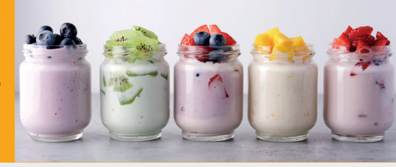
page 1 / 2